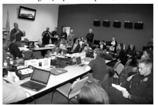
Figure 1—Planning meeting

The second step is to conduct training so that personnel can safely and effectively complete their duties as spelled