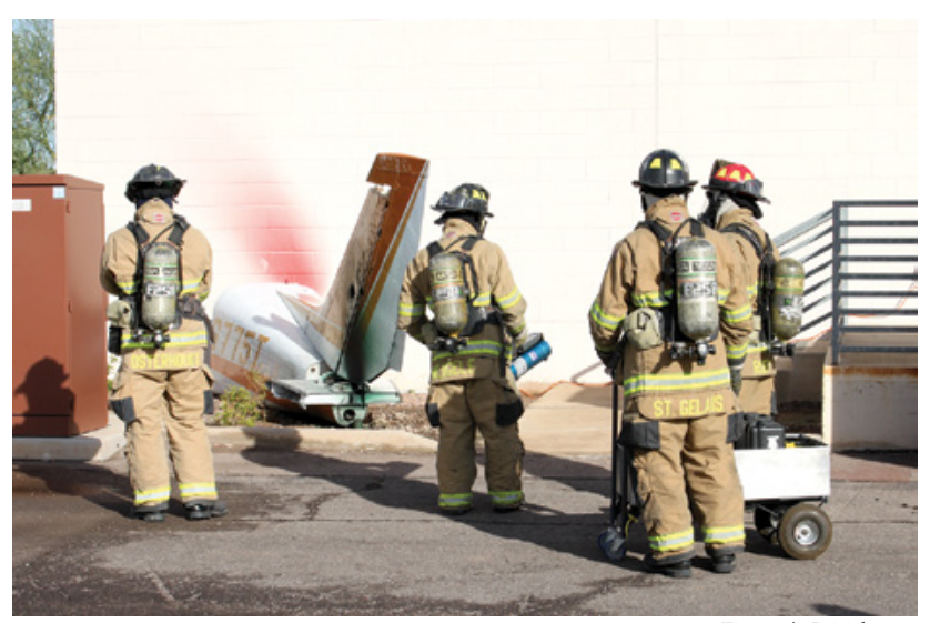
Figure 4--Initial entry