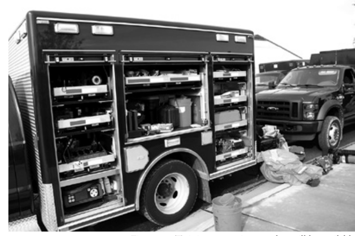
Figure 2—Training on equipment that will be available

checklists are identified based upon the lessons learned from the exercise.