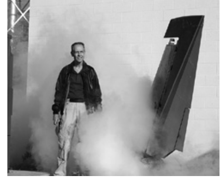
Figure 3--Aircraft Fuselage

Mesa and Gilbert Fire departments responded and discov-