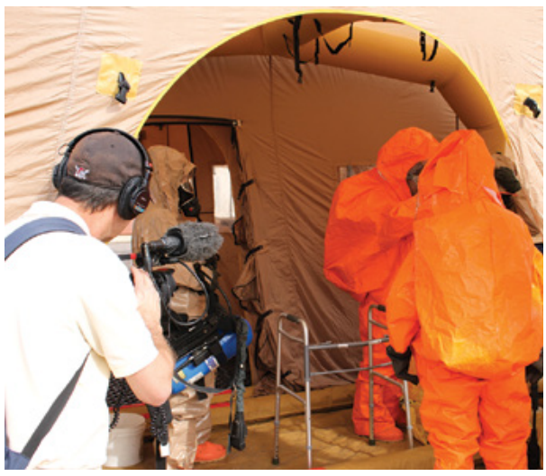
Figure 6--Decon with media close at hand

The final take away? Many different agencies and jurisdictions worked together, met, and got to know one another—this alone is a big win. Familiarity among responders enhances response effectiveness and efficiency!